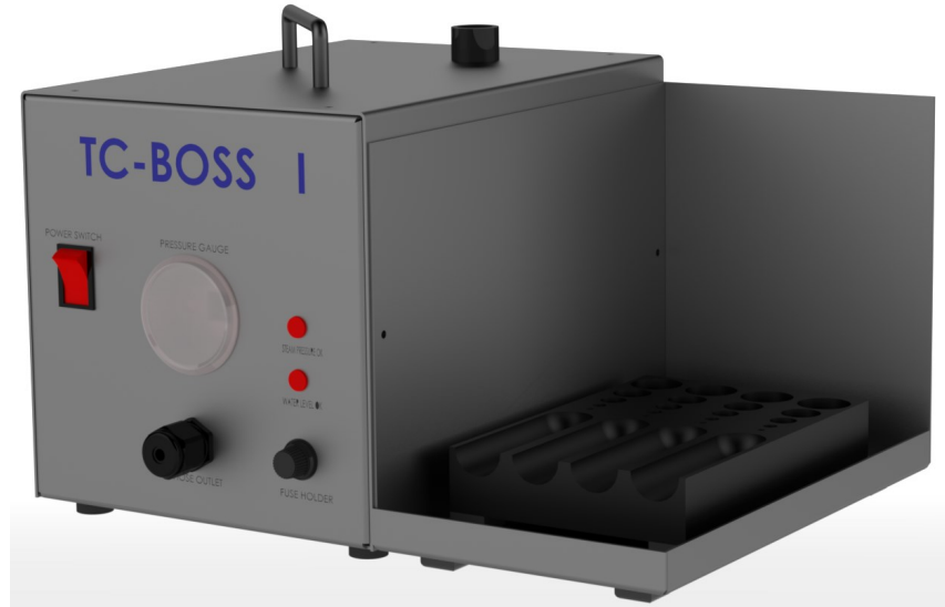
TC-BOSS Cutting Tool Steam Cleaner

The TC-BOSS Cutting Tool Steam Cleaner Unit is the only device needed to achieve a truly clean, debris free cutting tool.